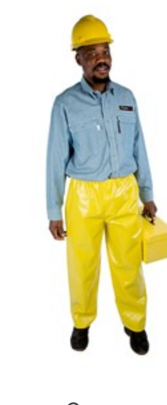
AQUA-TECH® Trousers - Medium weight MEDIUM WEIGHT GARMENTS