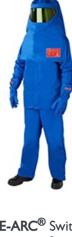
SURVIVE-ARC® Switching suit 51.5 cal/cm 2 CAT 4 SWITCHING SUITS

SURVIVE-ARC® protective wear is made from certified, comfortable-to-wear, permanently flame-resistant and arc-rated material to protect the worker against the ... Read more