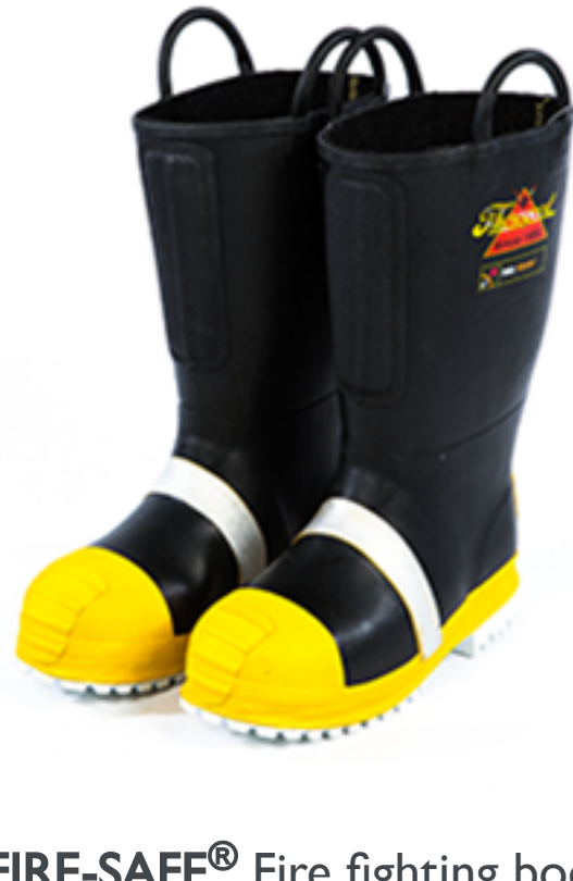
FIRE-SAFE® Fire fighting boots: structural and haz-mat ACCESSORIES