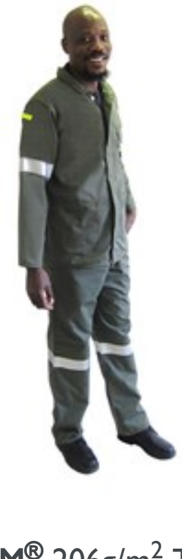
ACI-FLAM® 206g/m 2 Two piece coverall DAILY WORK WEAR

ACI-FLAM® offers a unique, specialised range of garments for protection against concentrated and hazardous acids and chemicals, such as ... Read more