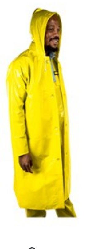
AQUA-TECH® 125cm Coat with buttons and hood - Medium weight MEDIUM WEIGHT GARMENTS