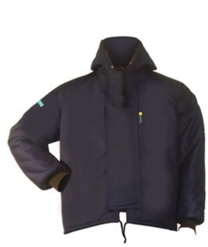
ZERO-TECH® 88cm Flame-resistant waterproofer jacket with hood FLAME-RESISTANT WORK WEAR

ZERO-TECH® garments are designed for protection in cold conditions. The ZERO-TECH® brand offers garments which are flame-resistant, either come with ... Read more