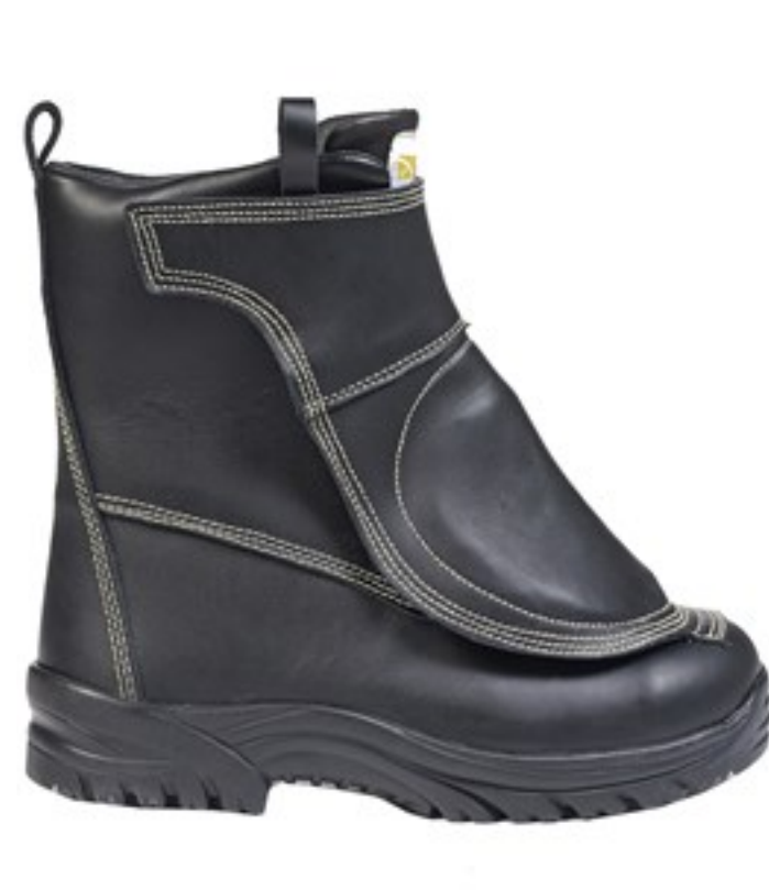
ALU-SAFE® CHARNAUD hot metal boot ACCESSORIES