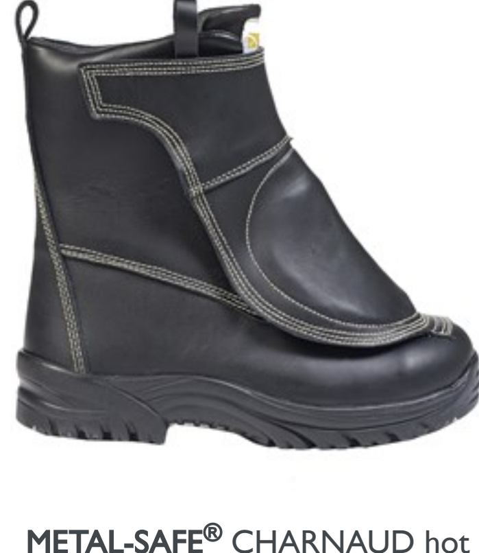
METAL-SAFE® CHARNAUD hot metal boot METAL-SAFE®