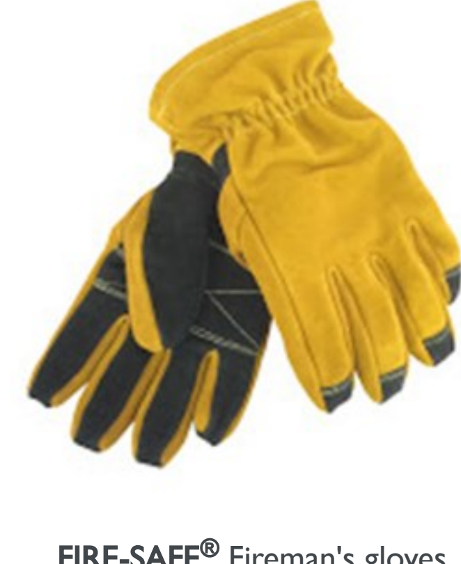
FIRE-SAFE® Fireman's gloves ACCESSORIES