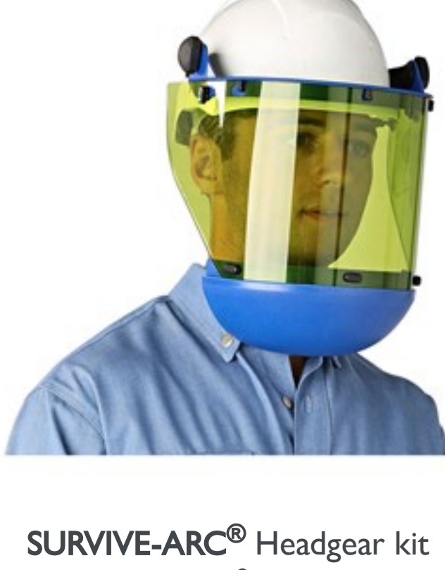
SURVIVE-ARC® Headgear kit 12 cal/cm 2 CAT 2 ACCESSORIES