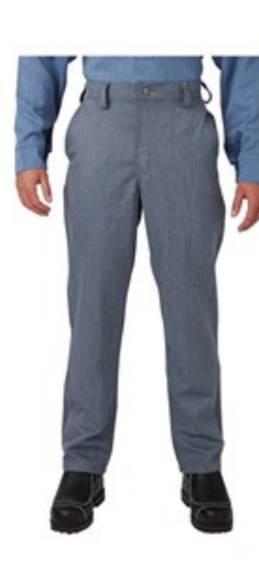
ALU-SAFE® QV664 330g/m 2 Casual trousers D3 E3 SMELTER GARMENTS