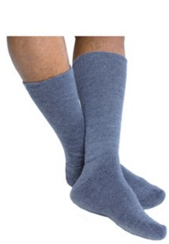
ZERO-TECH® CHARNAUD Thermal socks FLAME-RESISTANT WORK WEAR