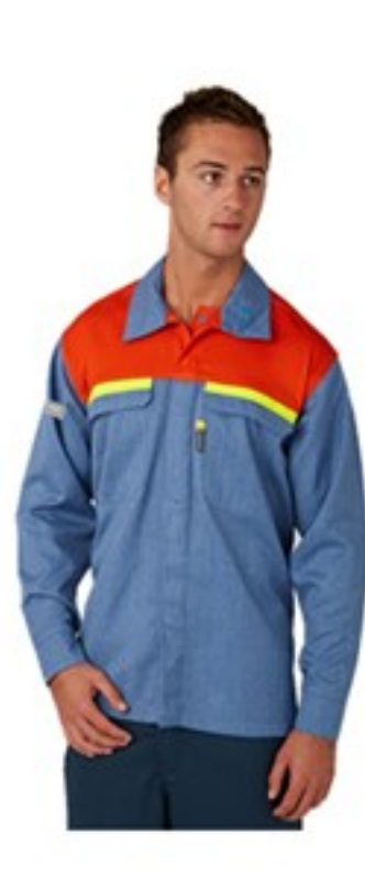
ALU-SAFE® QV803 210g/m 2 Two-tone open front shirt DI E1 SMELTER GARMENTS

ALU-SAFE® is an international certified unique high-performance workwear fabric and garment system. These garments protect workers against the hazards of ... Read more