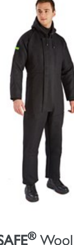
METAL-SAFE® Wool One piece tapping suit METAL-SAFE® WOOL