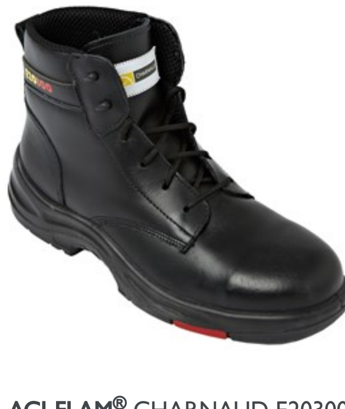
ACI-FLAM® CHARNAUD E20300 boot DAILY WORK WEAR