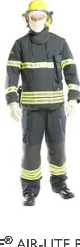
FIRE-SAFE® AIR-LITE Bunker Suit FIRE FIGHTING GARMENTS

FIRE-SAFE® comprises a full range of permanently flame-resistant workwear garments for protection against flames and fires. These garments are ... Read more