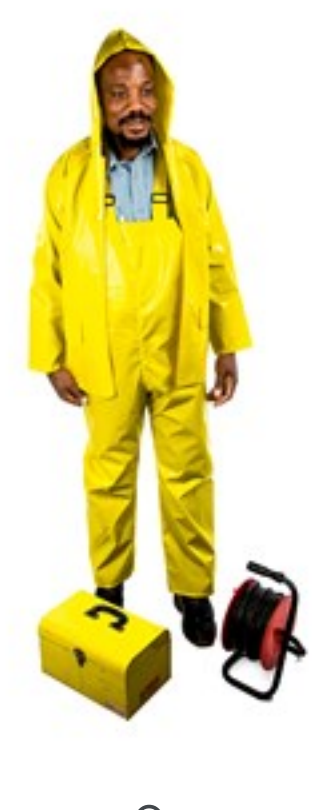
AQUA-TECH® Bib-and-brace trousers - Heavy weight HEAVY WEIGHT GARMENTS