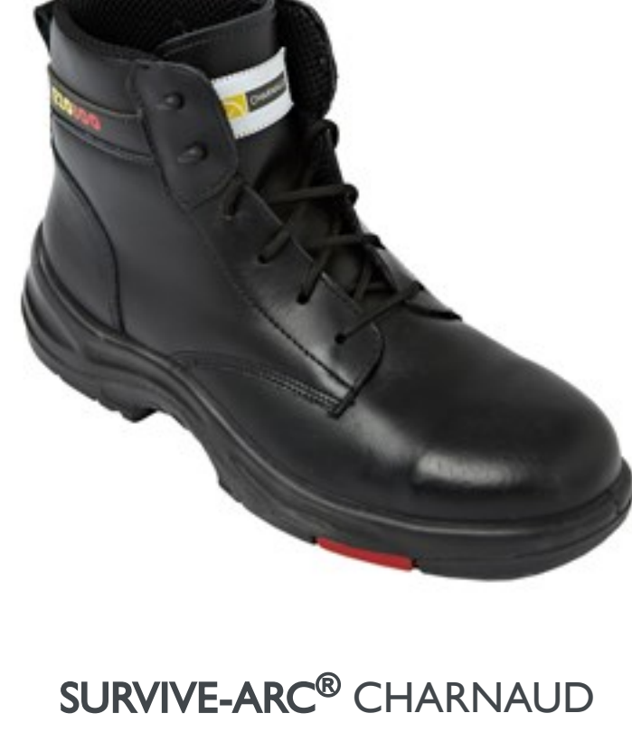
SURVIVE-ARC® CHARNAUD E20300 boot ACCESSORIES