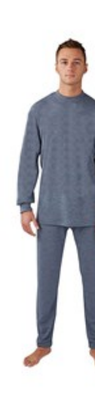
ALU-SAFE® 270g/m 2 Long sleeve T-shirt ACCESSORIES