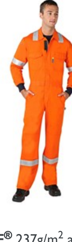
FIRE-SAFE® 237g/m 2 anti-static oil & gas coverall OIL AND GAS