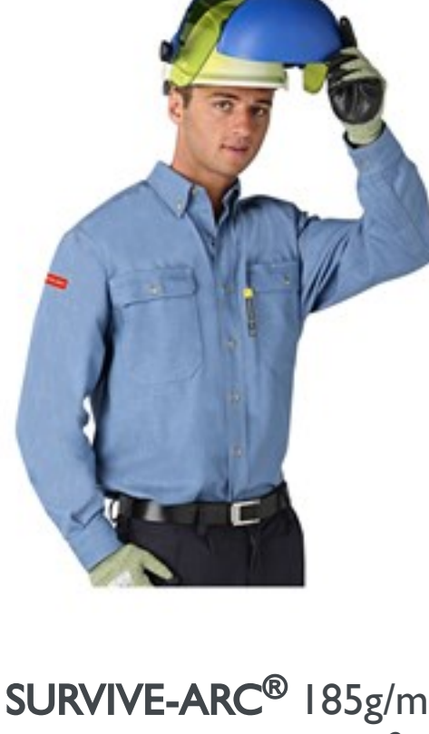
SURVIVE-ARC® 185g/m 2 Chambray shirt, 8.3 cal/cm 2 CAT 2 DAILY WORK WEAR