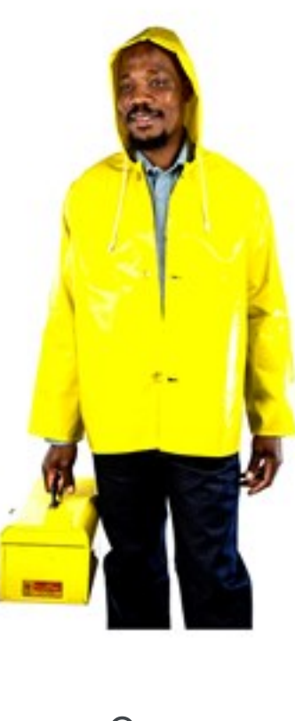
AQUA-TECH® 76cm Jacket with buttons and hood - Medium weight MEDIUM WEIGHT GARMENTS

AQUA-TECH® waterproof industrial workwear is designed for use in the industrial, mining and agricultural industries. These garments are manufactured ... Read more