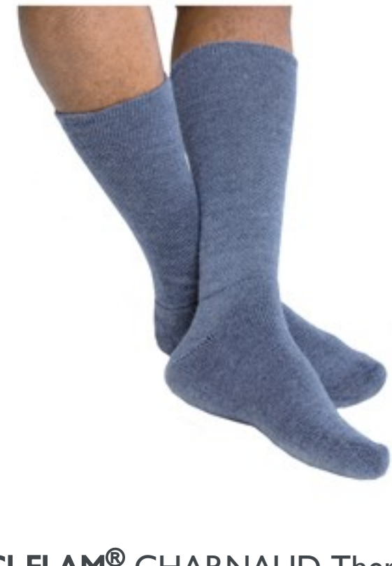
ACI-FLAM® CHARNAUD Thermal socks DAILY WORK WEAR