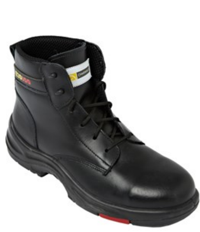
ZERO-TECH® CHARNAUD E20300 boot FLAME-RESISTANT WORK WEAR