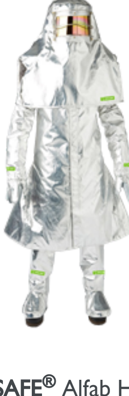
METAL-SAFE® Alfab Hood with clear or green visor METAL-SAFE® ALFAB

The METAL-SAFE® range offers complete protection against molten metal 'red metal' splash, radiant heat, flames and the hazards of ... Read more