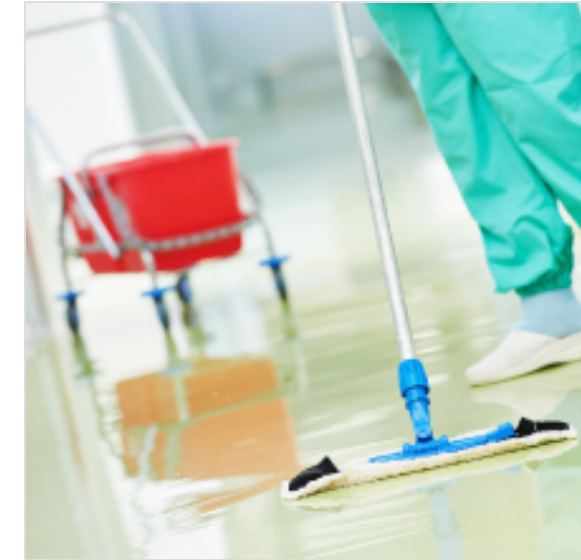
Floor Pads / Tools