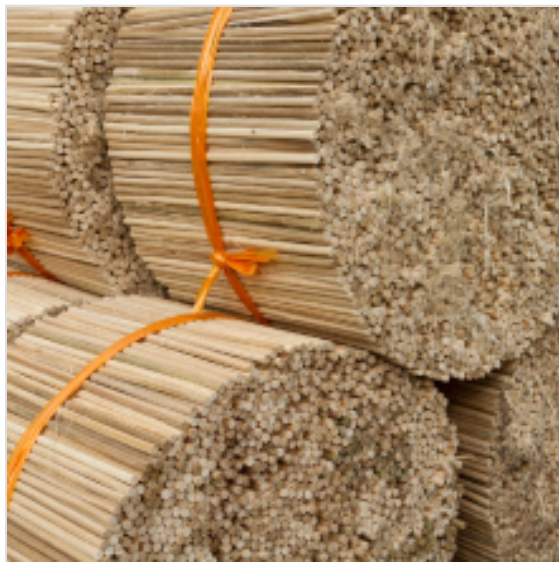
Handles & Sockets